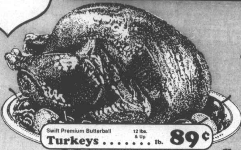
Swift Premium Butterball 12 lbs. & Up Turkeys ..... lb. 89¢

A Variety of All Your Holiday Meat Items: Hams-All Brands; Bone In & Boneless, Raw & Cooked; Ducks, Geese, Capons, Cornish Hens, Fresh Hens, Fresh Turkeys and Oysters: (Standard & Select 12 Oz. Cans)