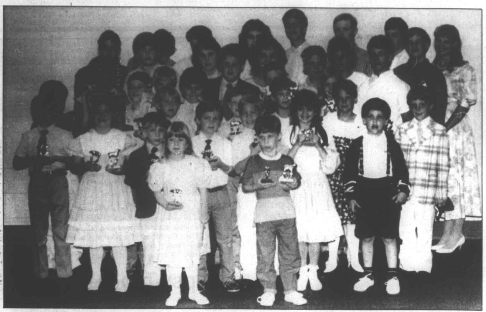
Over 50 Perquimans County youth entered animals in the annual 4-H livestock show. They represented Perquimans County well, as they brought home reserve champion trophies in all three livestock divisions, a grand champion trophy, and

took the top three places in the swine judging. Here they are after the awards banquet held at the K. E. White Center at ECSU.