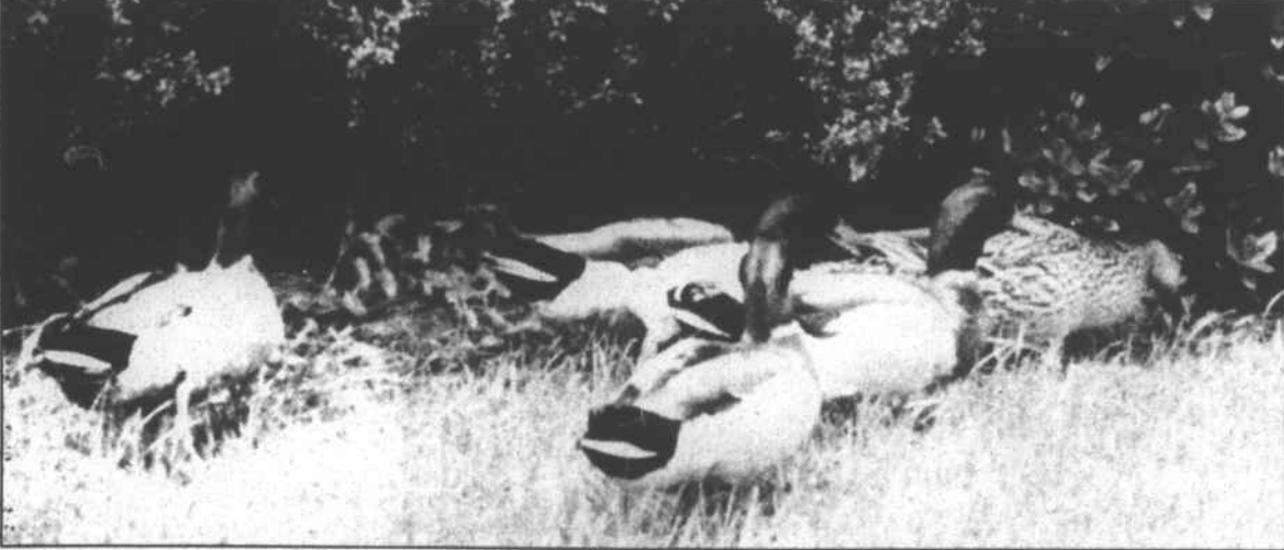
Mallard ducks visited the Hertford Municipal Building last week. Employees fed the fowl corn, and tried to coax them to the back of the building where they would not be in as much danger of being hit by cars, but the ducks said, "No." They stayed at the front of the building.