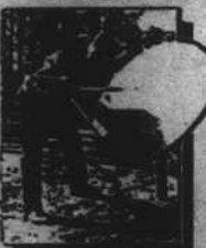
The small PRIMESTAR dish (about 3 feet in diameter) and receiver do it all!

Small Dish - Big Breakthrough - About $1 A Day! Can't get cable, but want more affordable entertainment choices? Get PRIMESTAR! Our small dish (about 3 feet in diameter), along with a receiver, is all you need to enjoy movies, sports, family shows and more... for only about $1 a day.