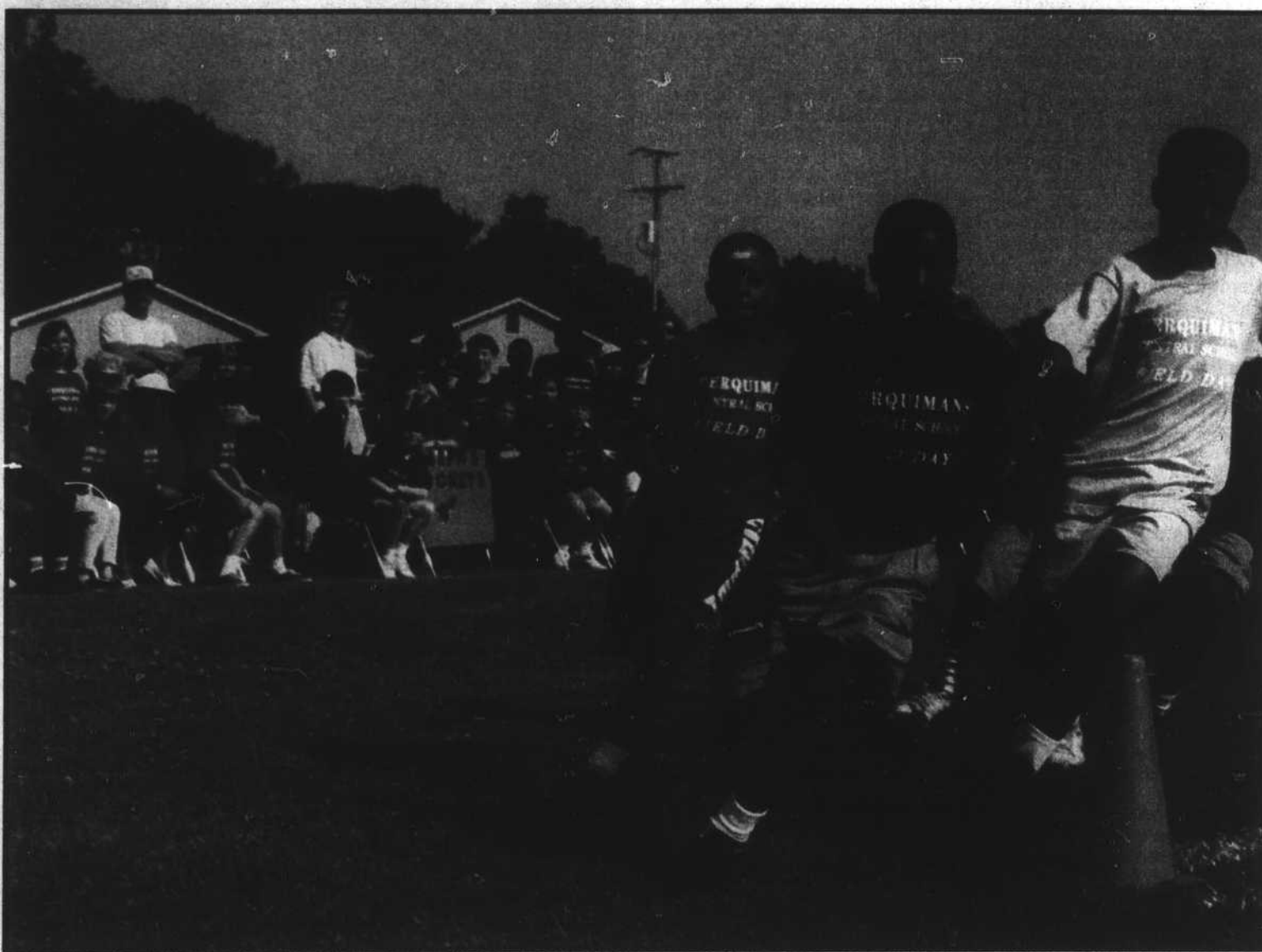
Central School students ran as fast as they could last Friday during field day competition. Each class was decked out in field day T-shirts sporting class colors. Posters made by the classes with slogans like "Ralph's Rockets" and "Parker's Purple Power" decorated chairs by each classroom's designated cheering section.