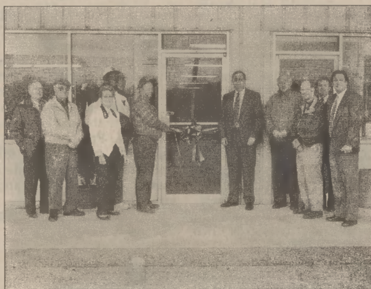
Friday, March 29 Howard's Hardware, Apple Tree Mall