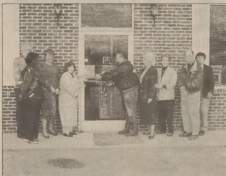
Wednesday, March 27 Papa's Seafood, Ward Shopping Center