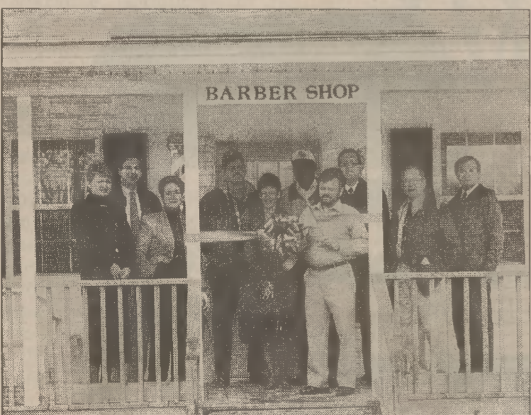
Thursday, March 28 Jimmy's Barber Shop, Harris Shopping Center