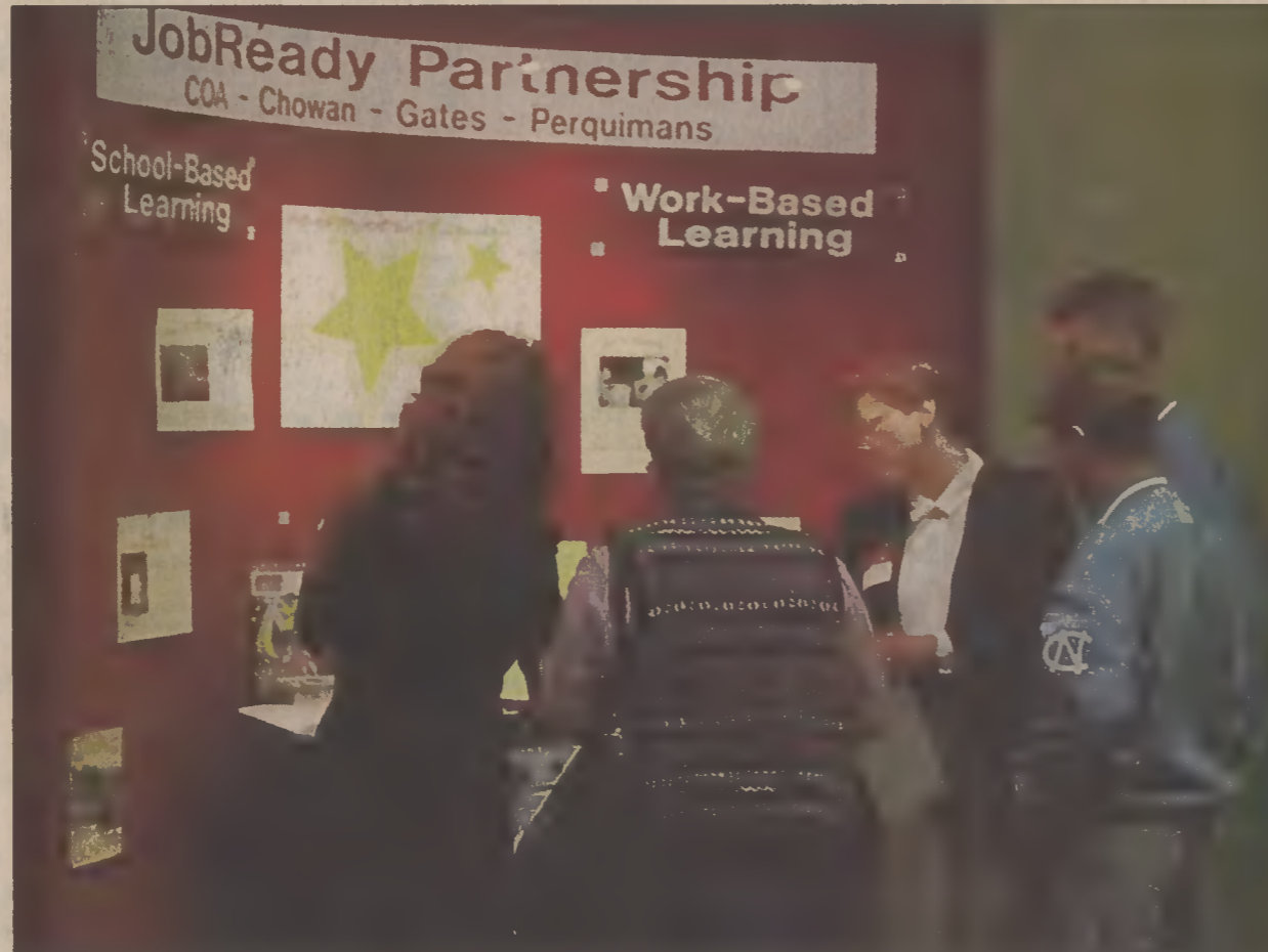
Students and parents look over the tri-county JobReady Partnership information.

Councilmen said they wanted to move quickly and not wait until September to make a decision. Please see US 17, page 3