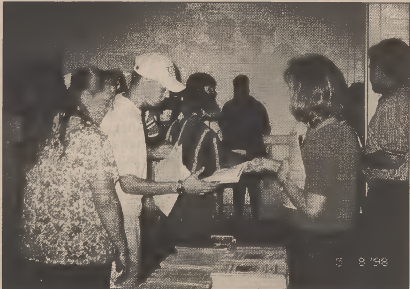
Parents and students were informed of requirements for senior projects at Perquimans County High School during Senior Orientation Night.

Seniors will be assigned an advisor and are encouraged to select a mentor in the career area of their choice, who will provide guidance and support in the Senior Project process. With the guidance of the English teacher, the advisor and the mentor, each student will select a topic to research that is related in some way to