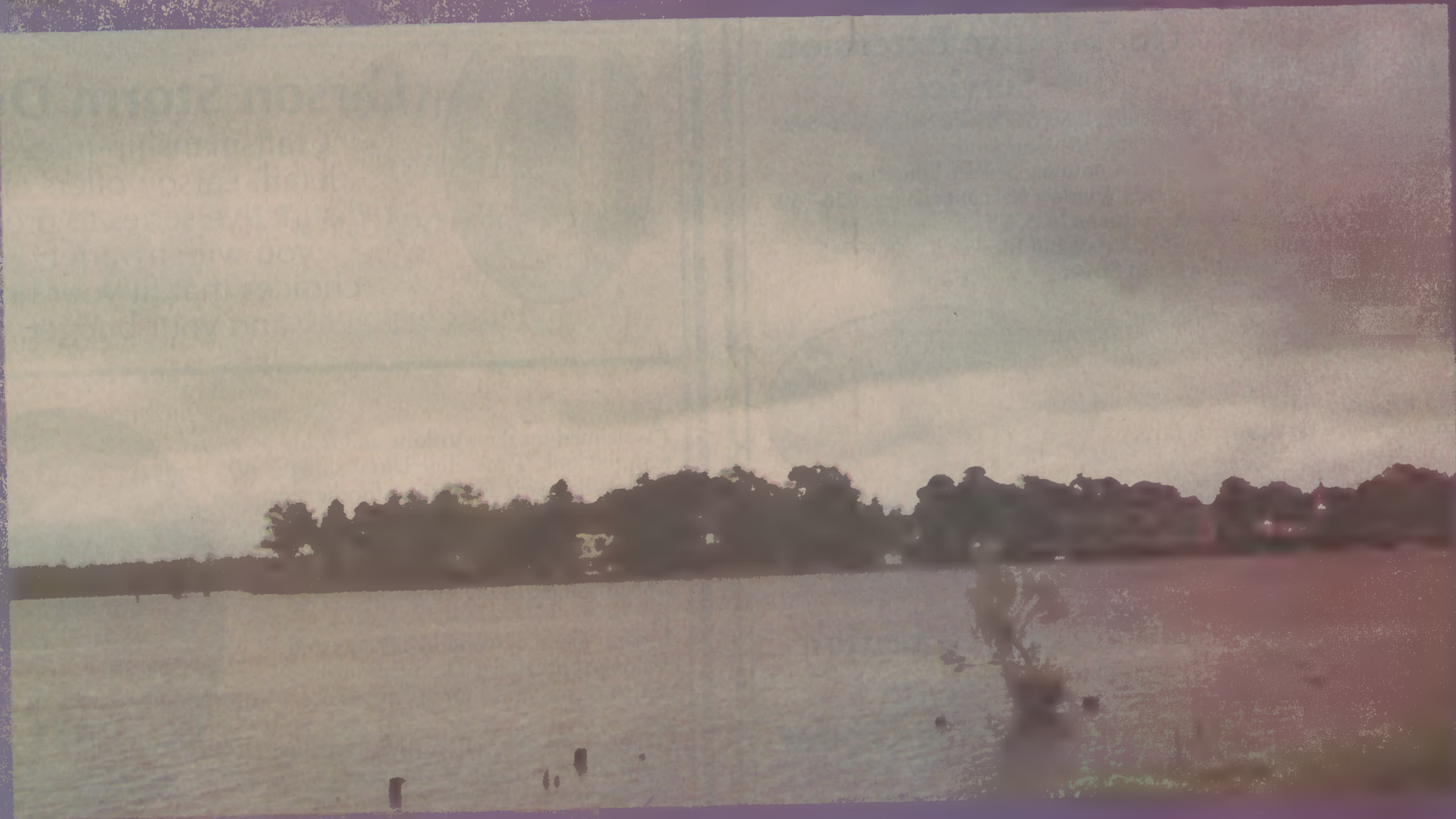
Progress Edition of 'The Perquimans Weekly' June 24, 1999