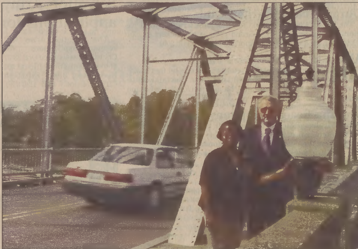
Local officials gathered by the S-bridge Friday to celebrate receipt of a federal grant that will install 1920s lighting on the bridge and two blocks of Church Street, as well as bury utility lines.

Funding for the beautification project, which comes from a pool of funds called TEA-21