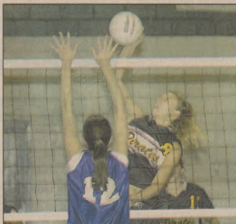
The Lady Pirates earned their second trip to the state volleyball championships in as many years with a big win in the regional title game Tuesday night.

The Lady Pirates struggled in game two, using