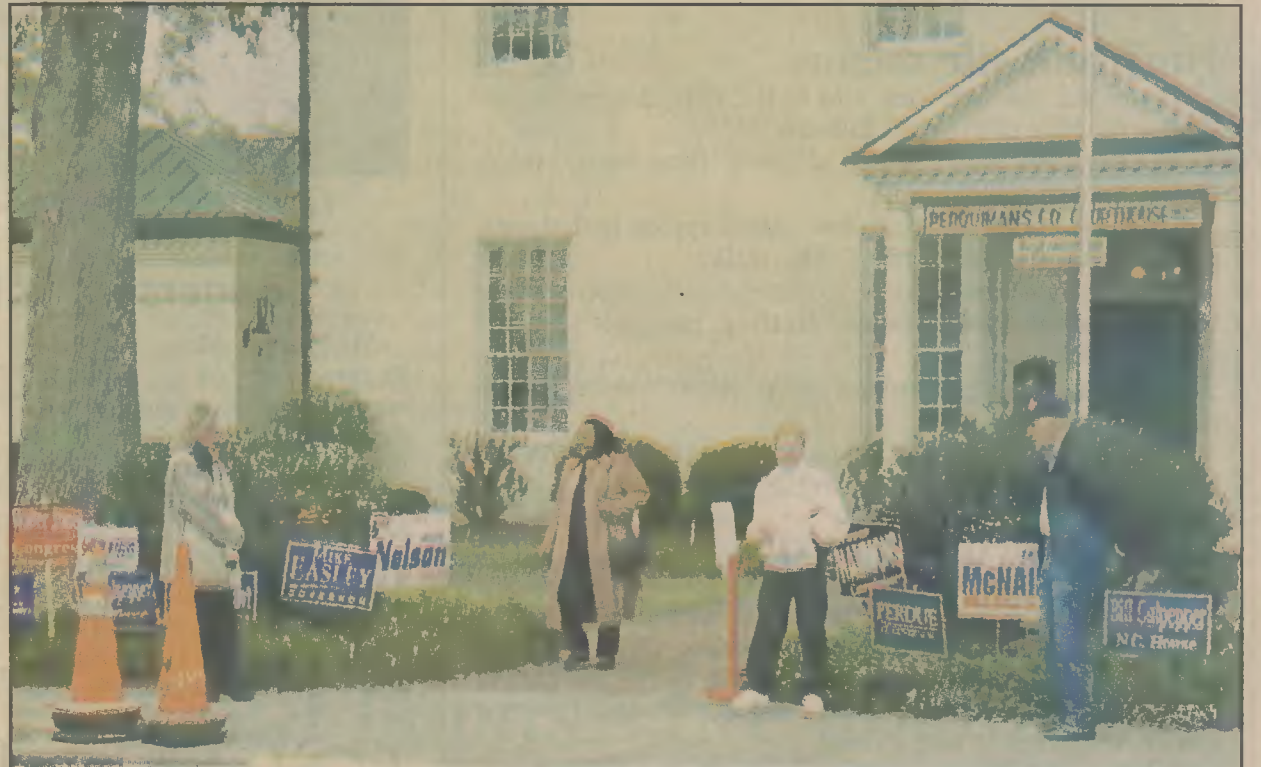
Candidates and their representatives braved the cool election day temperatures and cloudy skies to do some last-minute campaigning at the polling places.