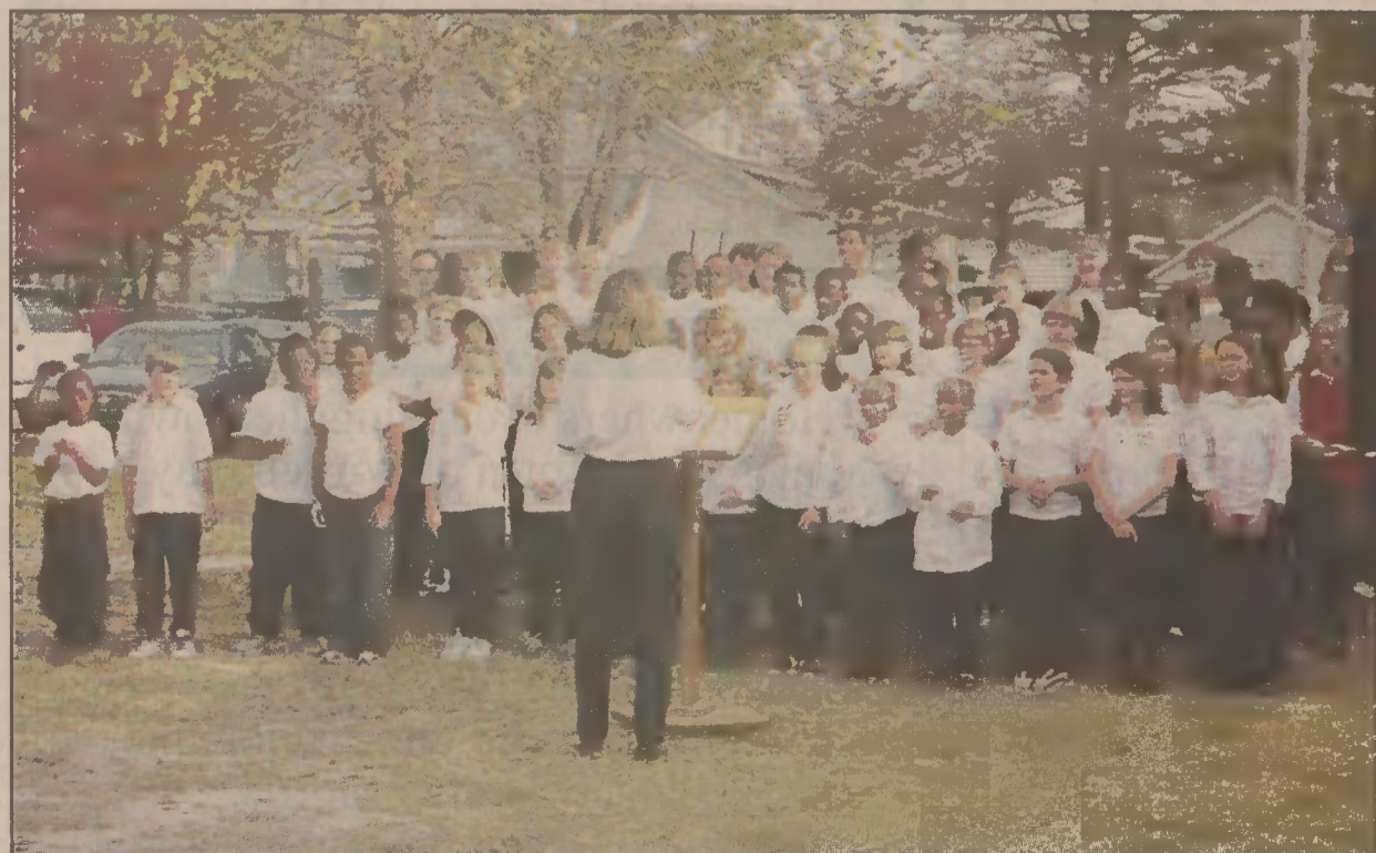
The Hertford Grammar School Chorus sings and signs "Remembering You" during the school's Veteran's Day program last Thursday.