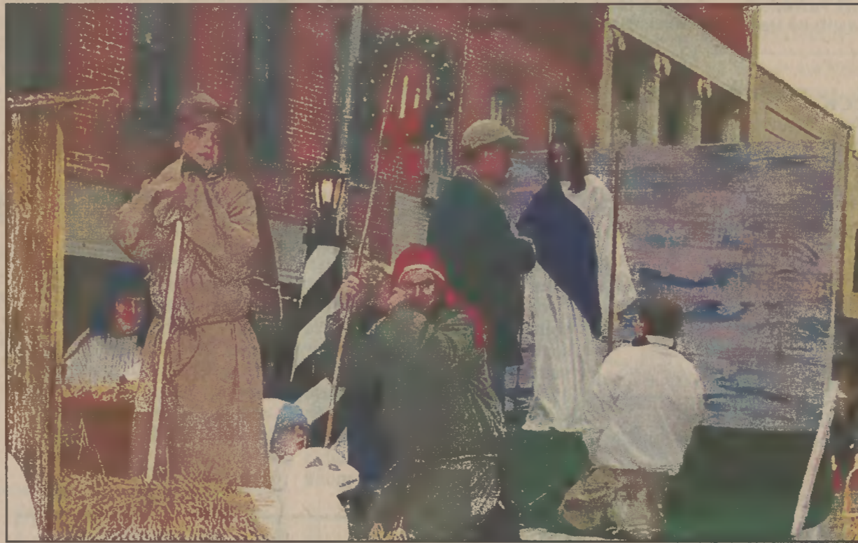
The Chappell Hill Baptist Church float was named Best in Parade Saturday when the Chamber of Commerce Christmas parade made its way through Hertford along with icy rains and wind.

Chappell Hill Baptist Church claimed the first See Parade, page 9