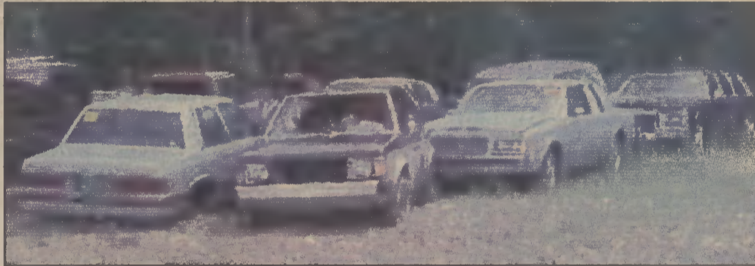
Cars are being collected for recycling at the tri-county landfill in Belvidere. Through a state junk car abatement pilot project, officials in Perquimans, Chowan and Gates counties hope to rid the area of 600 junk vehicles.