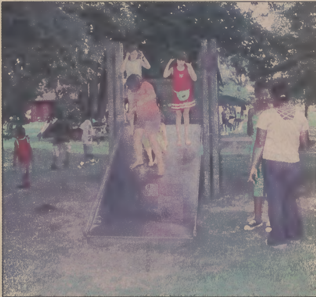
Children enjoyed Sunday afternoon in the park on July 1 at the Perquimans 4th of July celebration. Tag, sliding, swinging, and just talking with friends were popular activities at Missing Mill Park.