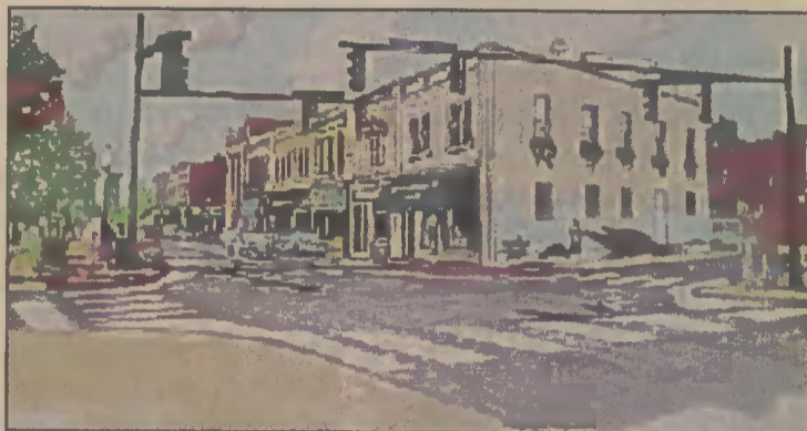
Part of the 5-year plan will be streetscapes, including a look at the intersections of Church and Grubb (left)

Hosted by the Town of Hertford Main Street Program, the presentation will be in the courthouse annex. Fourteen colorful streetscape designs, signage recommendations, area mapping, suggested plantings and more will be on display from 5:30-6:30