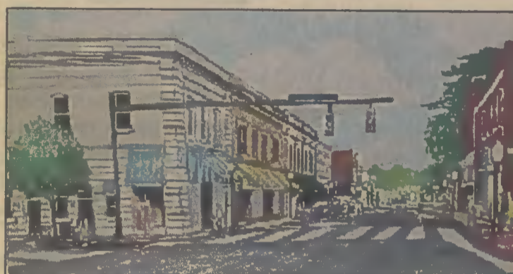
and Church and Market (right) streets. The plan will be presented on Jan. 23 at a public meeting.

tecture and engineering firm in Virginia Beach and Williamsburg, Va. and Raleigh. The company was hired by the town of Hertford to work with the Main Street Program to provide planning and design services for the