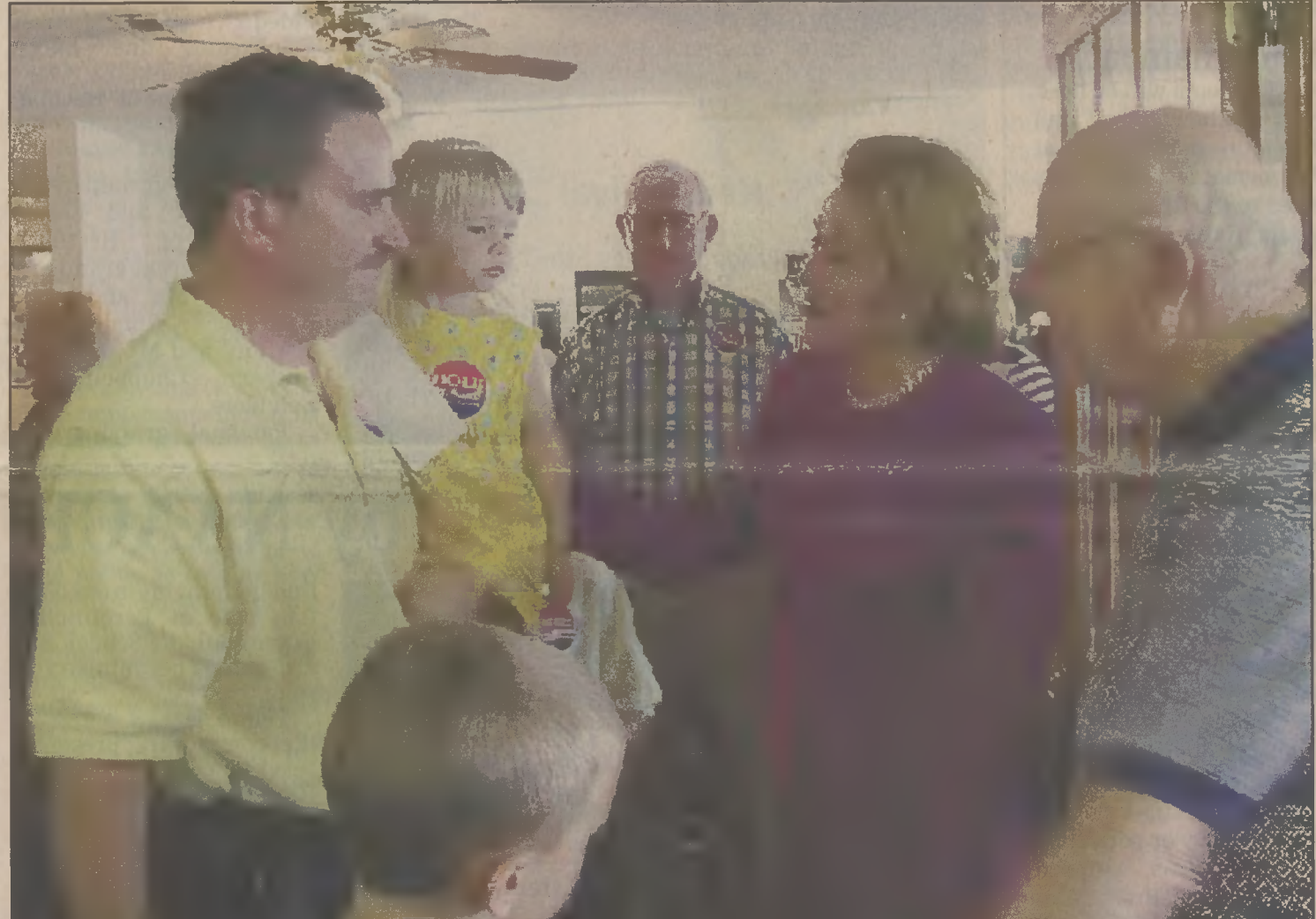
made a campaign stop in Hertford Friday on her visit county Republicans and others at Captain Bob's.