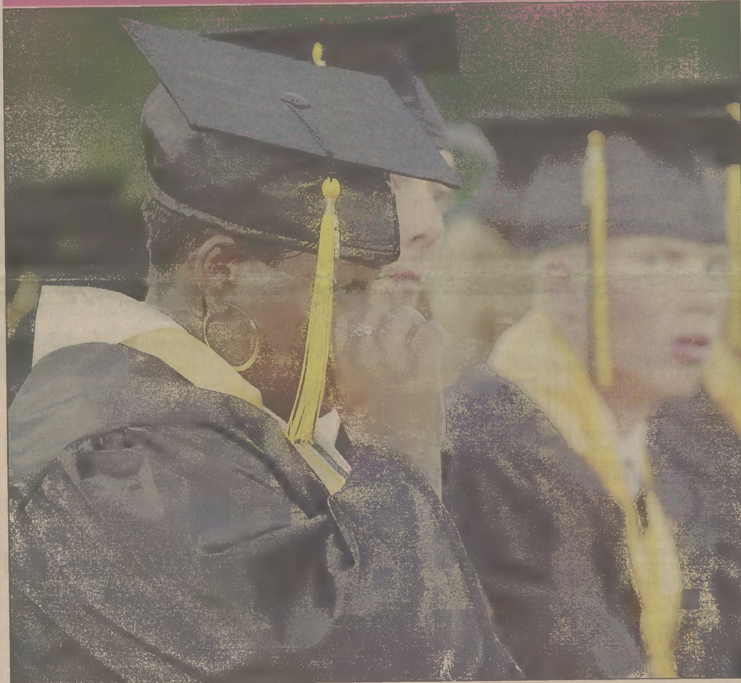
About 1700 family members and friends gathered to celebrate with the 97 members of the PCHS graduating class of 2002 Friday evening at Memorial Field.