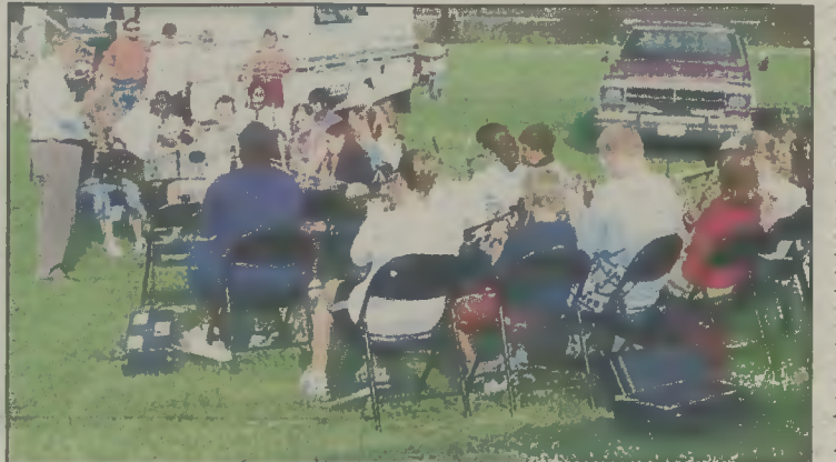
The Perquimans County Middle School eighth grade band was a big hit at Winfall Landing Park, a new venue for Indian Summer Festival.