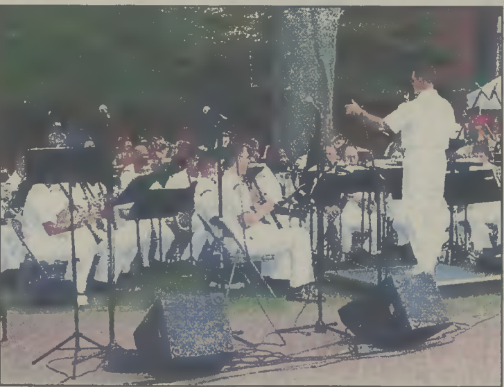
The Atlantic Fleet Band was one of the biggest crowd-pleasers downtown.