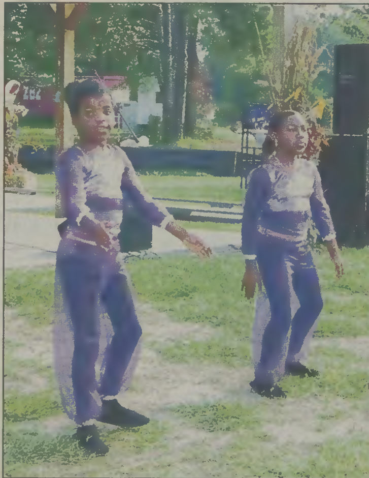
The Ellis Temple Praise Dancers opened the entertainment at Winfall Landing Park.