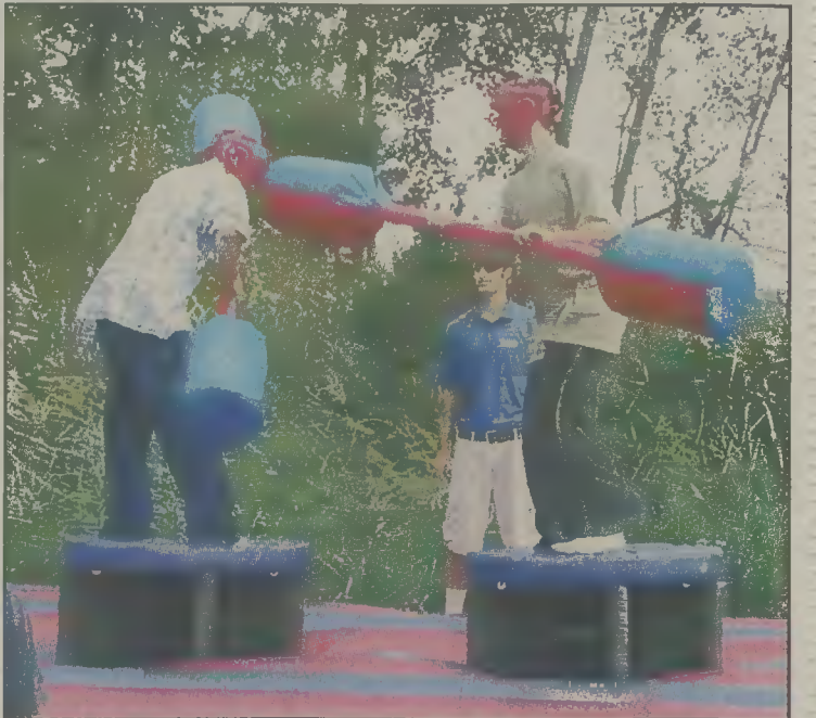
Youth enjoyed friendly battles at Missing Mill Park, pushing and punching with air-filled weapons.