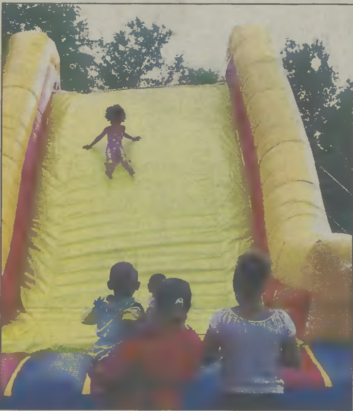
The younger set slid to fun at Missing Mill Park.