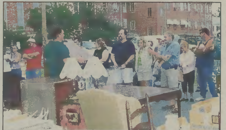
Bargain hunters and antique lovers gathered on Market Street Saturday afternoon for the very successful Antique Dealers Association of Perquimans County live auction.