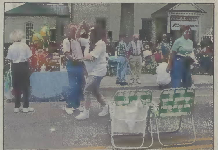
The entertainment was great at Indian Summer Festival 2002. Festival-goers took to the streets to shake a leg to the music of the bands downtown.