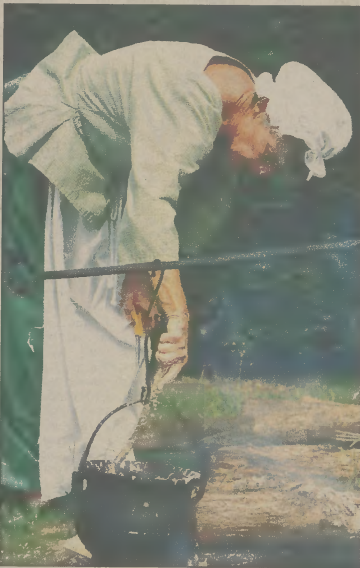
One of the highlights of the Hearth & Harvest Festival at the Newbold-White House was watching cooking over an open fire, then being able to purchase the Brunswick stew, apples and bread for lunch.