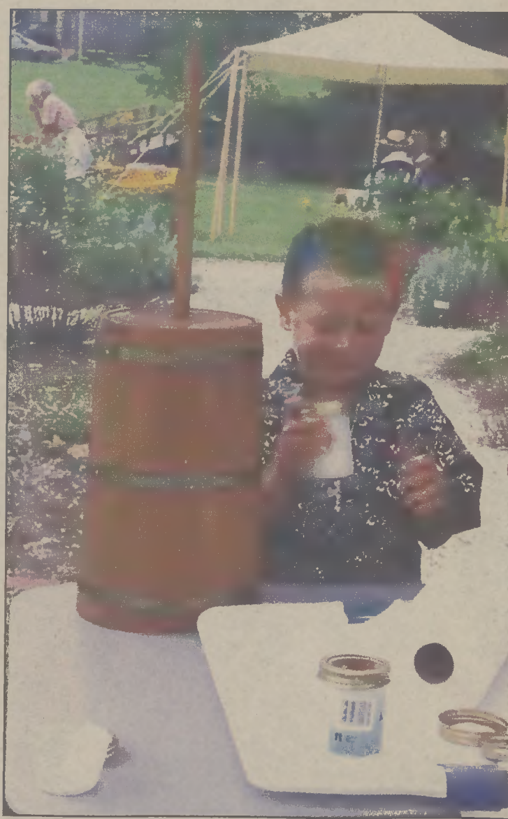
Among the numerous hands-on activities and demonstrations at Hearth & Harvest was butter-making, a treat for the young and history buffs alike.