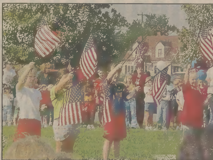
Students at Central School show their patriotism during a Sept. 11 observance. Programs remembering the heroism of Sept. 11, 2001 and those who lost their lives were held at all four schools.