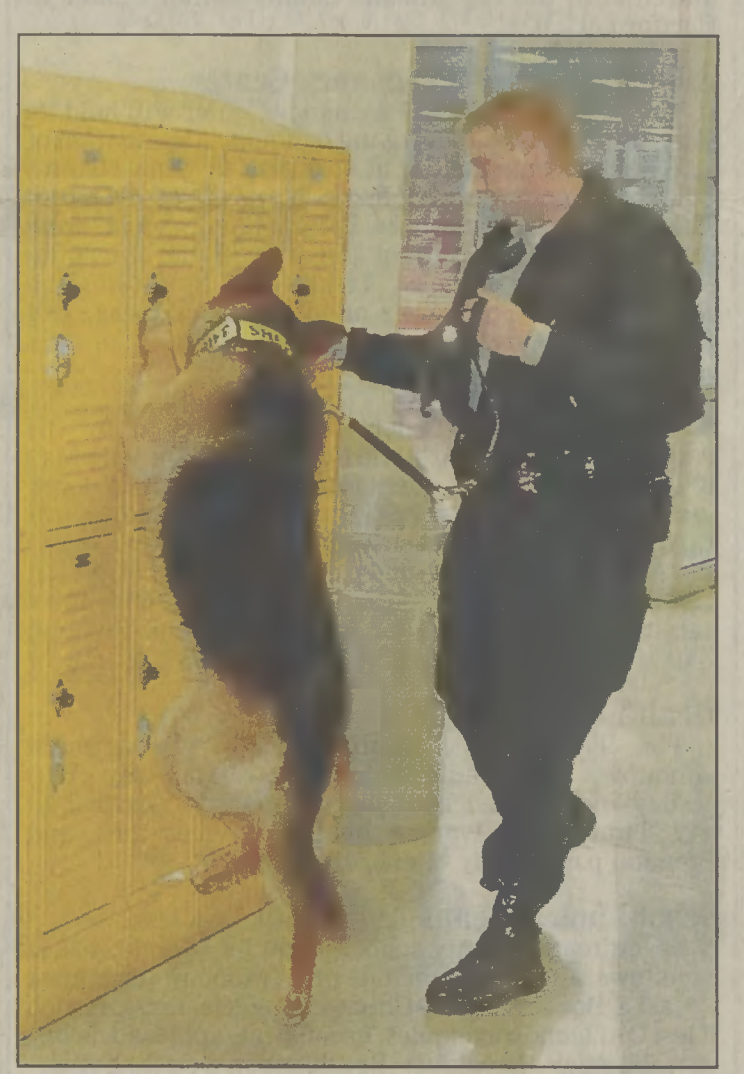
A canine unit from the Currituck County Sheriff's Department assisted with a locker search at Perquimans County High School recently. No drugs were found during the search.

Please note: Our email addresses have changed. We may not be able to retrieve your message if it is sent to our former addresses. We can be emailed at: