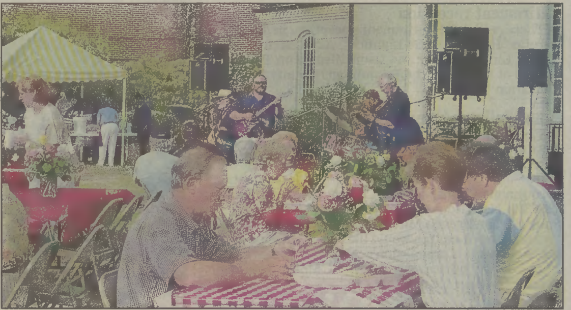
County residents and visitors enjoyed the annual Pig Out on the Green Friday evening on the courthouse lawn. Pork barbecue cooked on site and live entertainment provided a nice kickoff to the weekend.