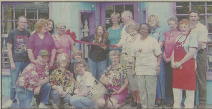
The Chamber of Commerce sponsored a ribbon cutting for Beyond the Garden Gate, a new business in downtown Hertford, Friday.

The store boasts the largest art rubber stamping collection in the Albemarle. If a craft supply is not