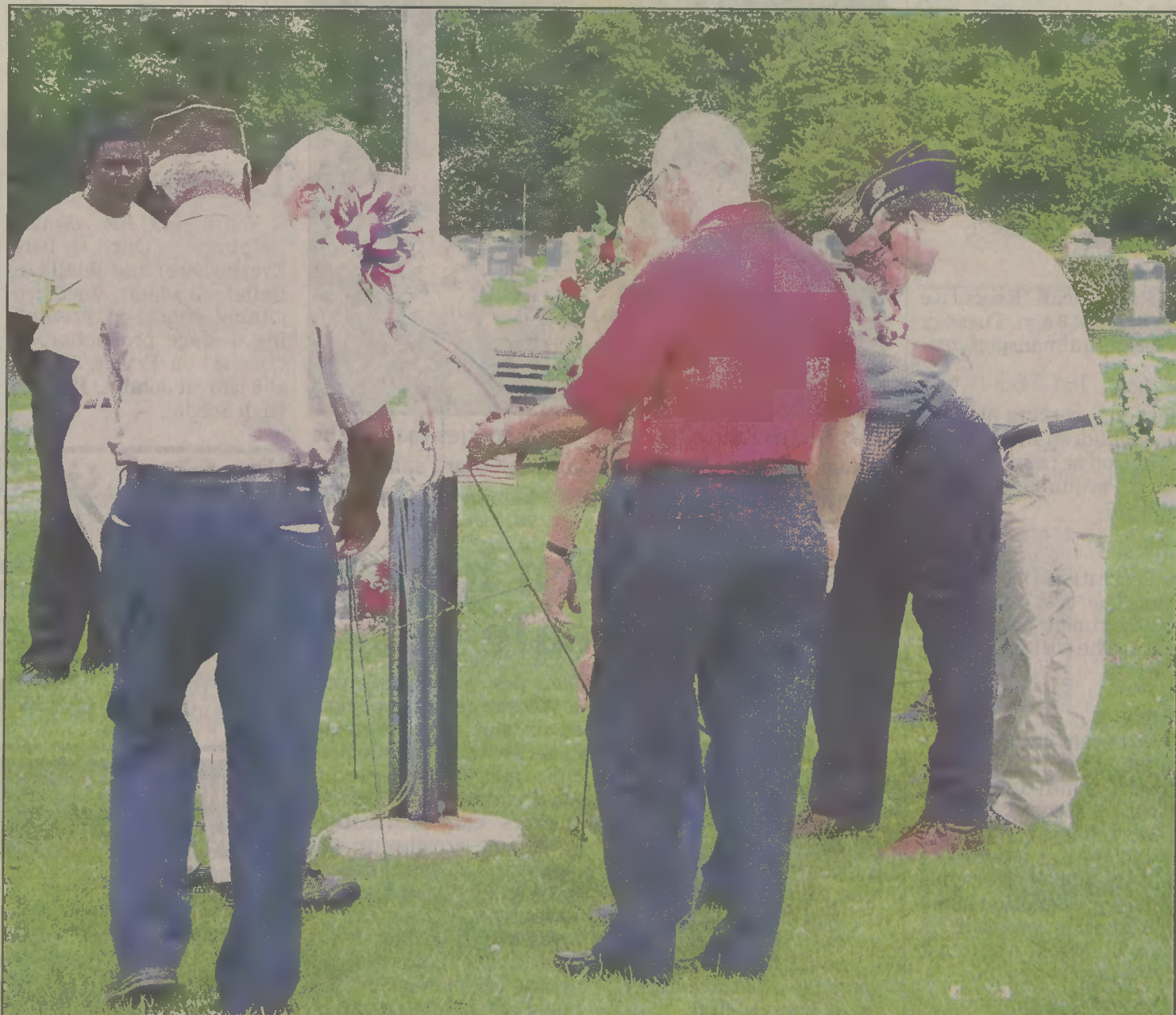
Local veterans place wreaths in honor of their fallen comrades at the foot of the flag pole at Cedar Wood Cemetery Monday during a Memorial Day observance.