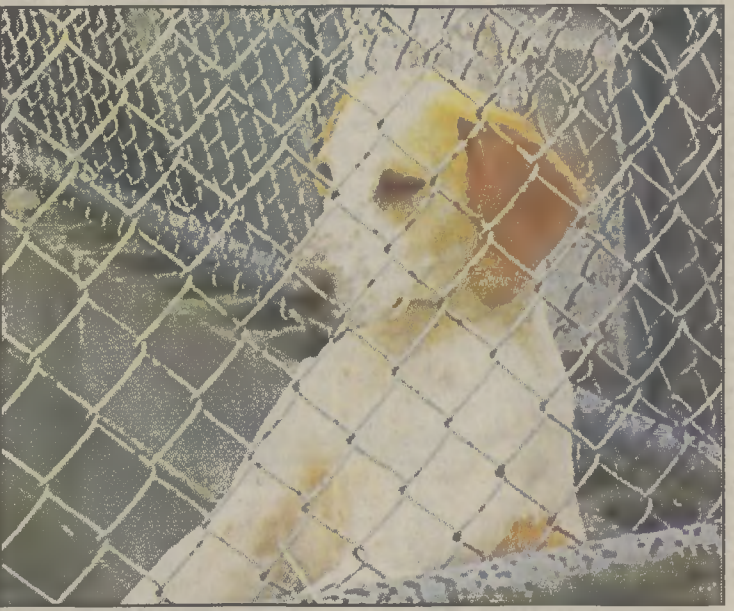
Patches is a fun-loving dog that gets along well with other dogs. He is a 2 1/2 year old Walker Hound who was found starving and alone in the Snug Harbor/Shady Oaks area of Hertford. He needs a place to run and is very good with children and other dogs. He may be seen at the Chowan Animal Hospital (482-4113) or call 426-6587 and leave a message.