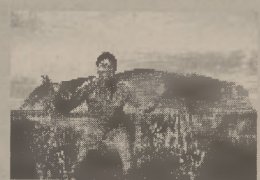
You'll see Steve Irwin, The Crocodile Hunter.

choices. From a company you can trust... Mediacom!