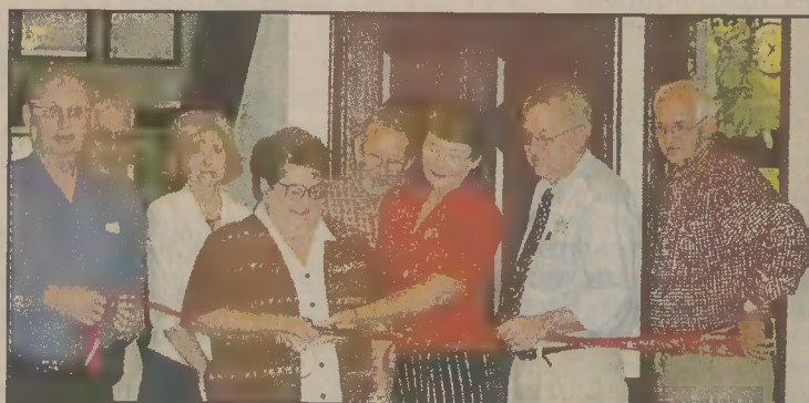
The Chamber of Commerce sponsored a ribbon cutting in honor of the grand opening of Hertford's newest business, Our Nook and Cranny Craft and Gift Shop, operating in Hall of Fame Square on Church Street.