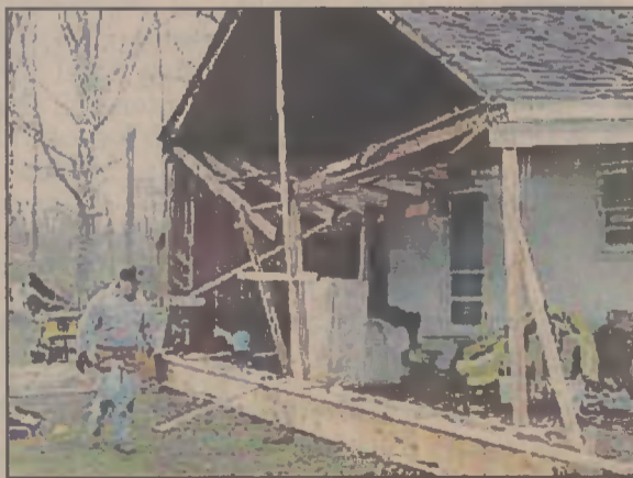
Hurricane Isabel blew through the Albemarle area with a fury, damaging thousands of homes throughout the area. The M.E.R.C.I. Northeastn Diaster Recovery Center in Edenton is helping those unable to afford home repair.

Once set up in November, the M.E.R.C.I. Center received 55 cases from the Chowan County Interfaith Disaster and Relief Effort, Inc. Since that time, many more families have applied for help. According to M.E.R.C.I. coordinators, many of