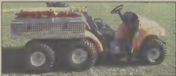
This ATV purchased with Homeland Security grant funds will help emergency responders answer calls in areas they cannot reach by vehicle.

The nearly $11,000 ATV, currently housed in the Hertford Fire Department, was purchased with a por-