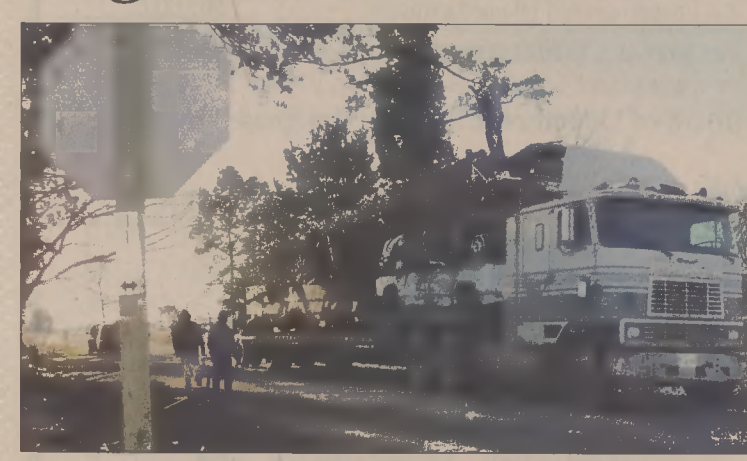
No one was injured in a truck wreck last week.