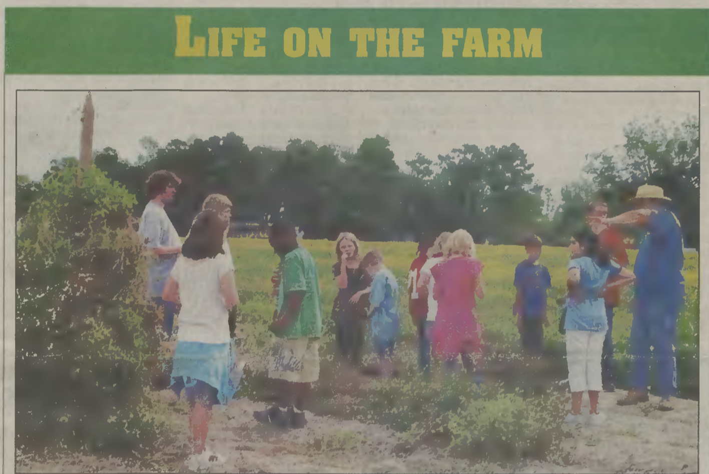
Perquimans Weekly Photos by CATHY WILSON

NCDOT is installing pilings and building a bridge over the old road and paving on top of it. Message boards have been installed around the area notifying vehicle traffic of the closure with a detour route identified.