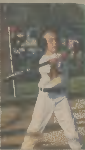
BATS ARE SWINGING, GLOVES are scooping, arms are pitching and guys are just hanging out at ball parks across Perquimans.