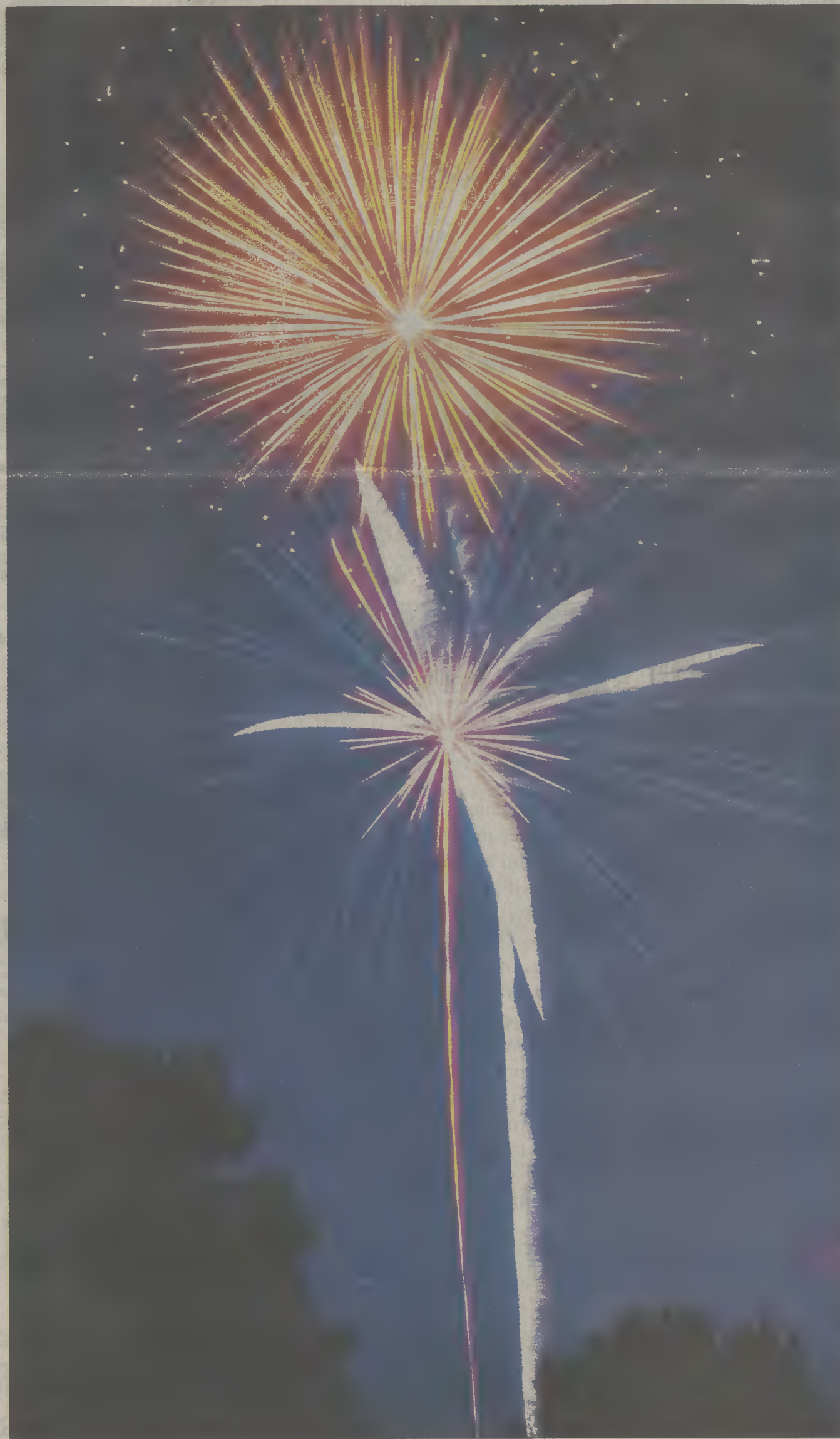
PERQUIMANS WEEKLY

The Fourth of July was all about fireworks, hot dogs, hamburgers, homemade ice cream, gospel music and a patriotic parade in Perquimans County, Saturday. Children and parents dressed in red, white, and blue, decorated their favorite non-motorized moving machines and paraded from Hertford Baptist Church to Missing Mill Park. Folks cooked on the grill, played on the slide, and enjoyed gospel music in Winfall. Even the ponies from Circle S Stables enjoyed the day dressed in their patriotic hats and glasses as local citizens celebrated the birth of this nation. The day ended with a colorful display of fireworks over the Perquimans River. Event organizers say they are still approximately $600 short in funds to pay for the fireworks. If interested in helping defray the costs, donations may be dropped off at the Perquimans Chamber of Commerce office. To see more photographs of July 4th activities in Perquimans County go to Page 9A. Also, check out the slide show at www.dailyadvance.com .