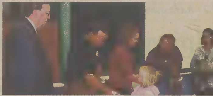
First-graders receive free books. Page 10.