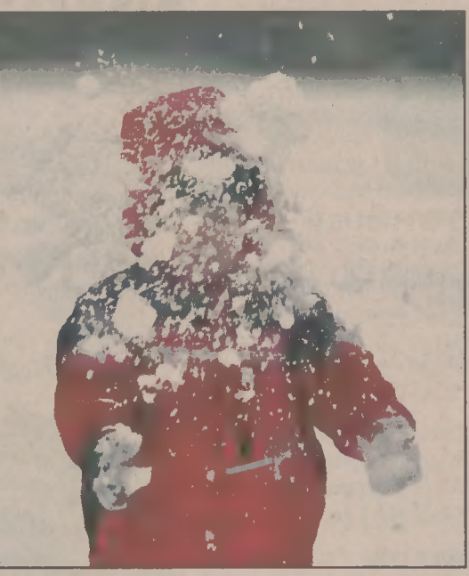
Woodville over the weekend.