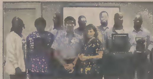
Perquimans County Schools custodians honored. Page 8