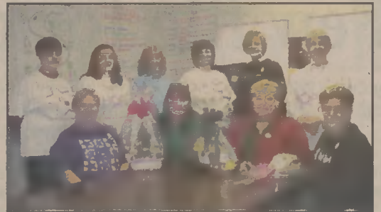
Relay for Life team plans auction. Page 8 RECEIVED