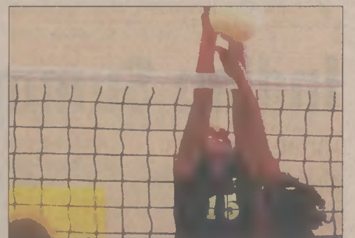
PCHS volleyball team roars past Gates, 7 Christmas comes in August, 9