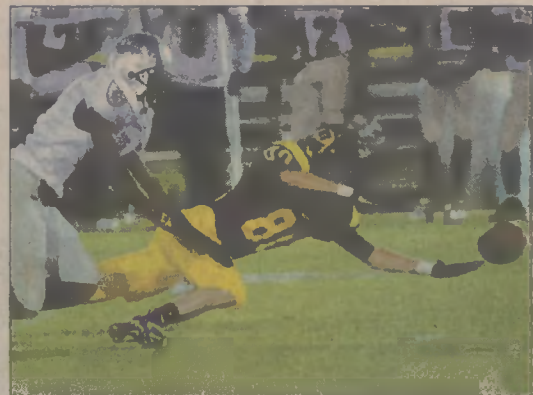
Pirates play Riverside tough in defeat, 8