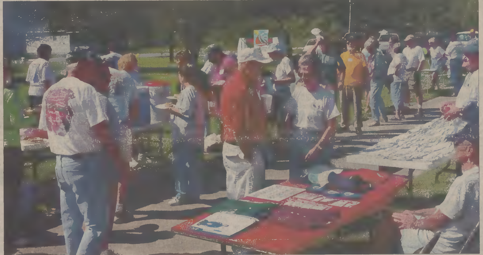
Food, people and good fun were in abundance recently during Snug Harbor's 40th anniversary celebration and Family Fun Festival.