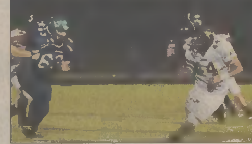
Pirates look to shake off loss, 9

It's Jones versus Halbert Dist. 4, N.C. Senate Seat, 2