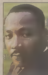
Dr. M.L. King Jr.