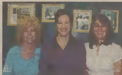
School employees earn certification, 2

Pirates advance; face Plymouth tonight, 6