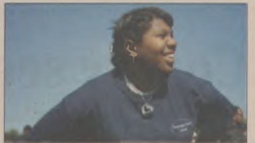
Perquimans students have fun at recent Special Olympics, 5A