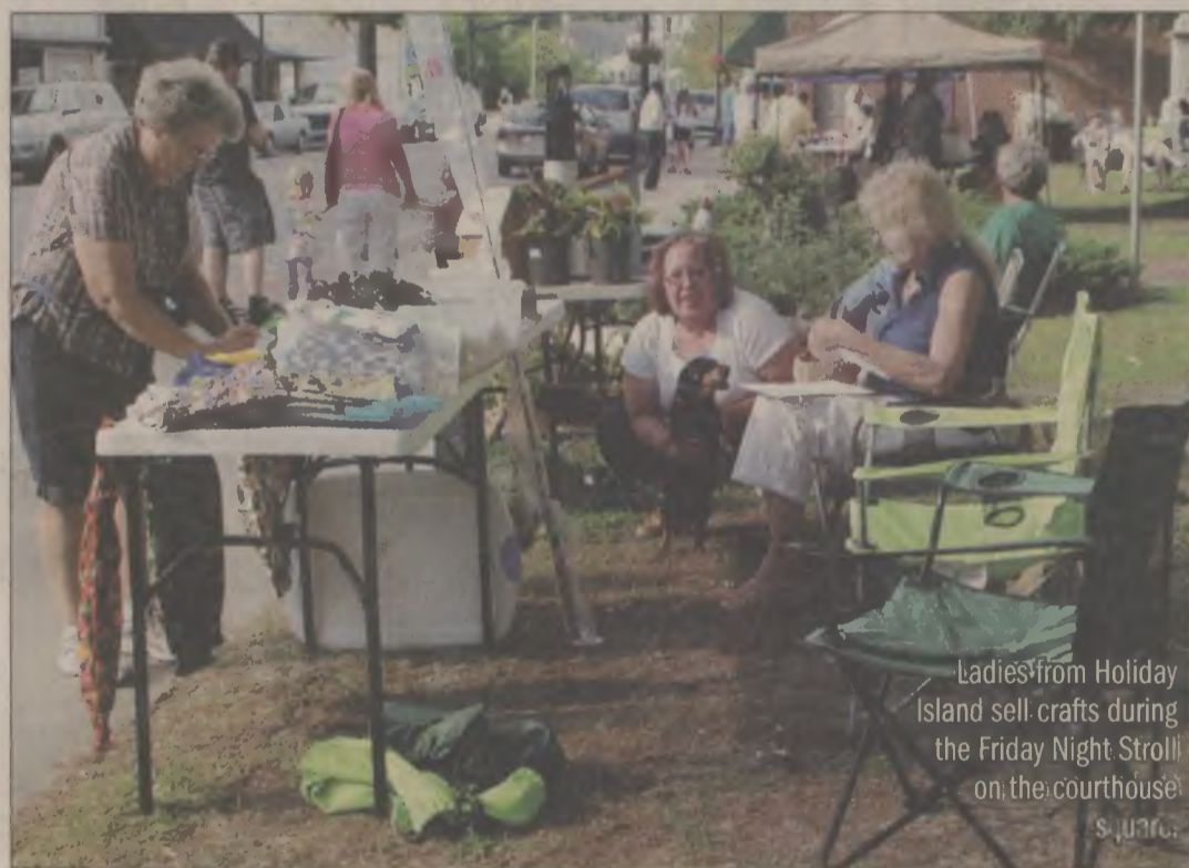
Ladies from Holiday Island sell crafts during the Friday Night Stroll on the courthouse square.