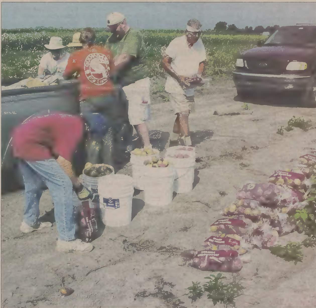
Local church members gather potatoes to be donated, along with other fresh, nutritious food, to those in need.

Residents from New Hope, Hertford and Edenton United Methodist churches, Immanuel Baptist, and the Open Door of Perquimans gathered at a farmer's field in Pasquotank County to glean potatoes for those less fortunate.