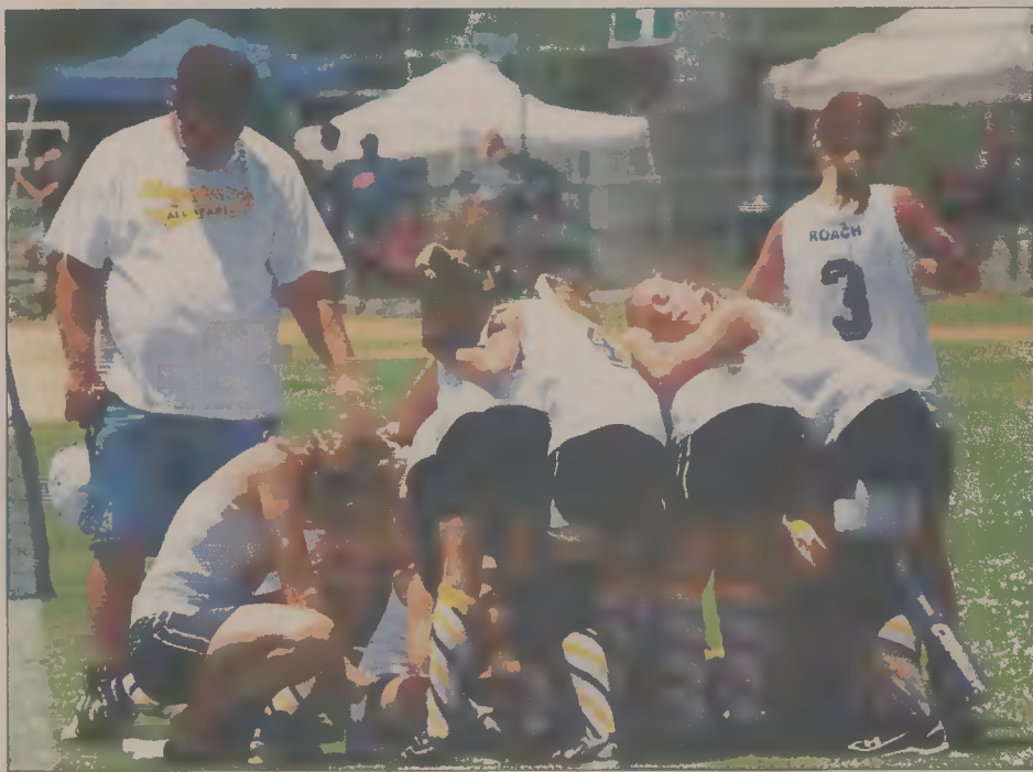
The 10U Perquimans All-Stars began every game with prayer.

Unbelievable ... that the local ladies who were down 5-0 in game 5, in the final inning, in their last bat and waiting for the last out to send them