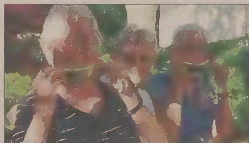
Residents have fun at Friday Night Stroll, 7