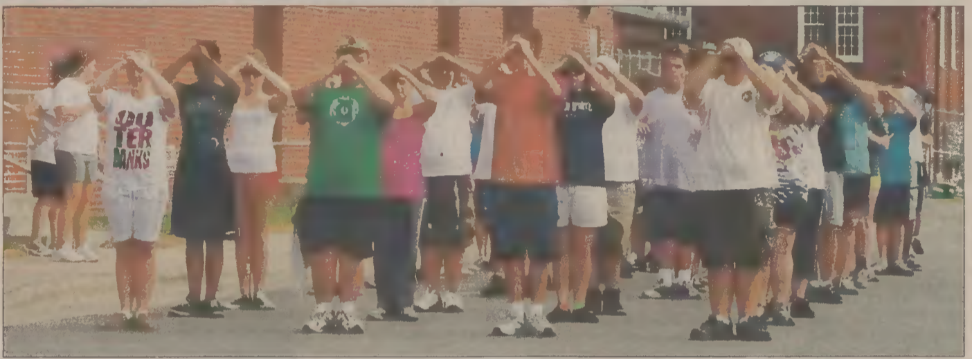
PERQUIMANS COUNTY SCHOOLS PHOTOS

The Perquimans County High School Marching Pirates held band camp last week despite temperatures pushing 100 degrees.