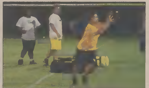
Midnight Madness a hit with Pirates football, P.6