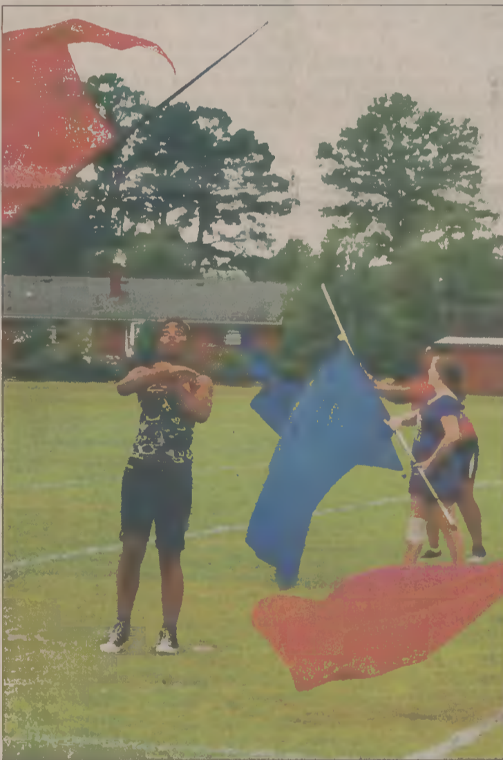
Even the color guard got in practice time during band camp.

The Perquimans County High School Marching Pirates held band camp last week despite temperatures pushing 100 degrees.