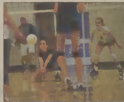
Lady Pirates post 2 marathon road wins, P. 7