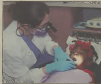
Local dentist helps kids smile, Page 7