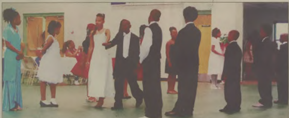
Contestants make their grand entrance during the Cinderella Ball, which raised money to help the Perquimans Community Angels attend a cheer/dance camp in Myrtle Beach this spring.