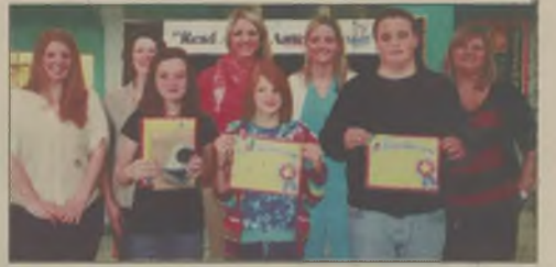
Junior Woman's Club holds poetry contest: Read this and other school news on pages 12-13