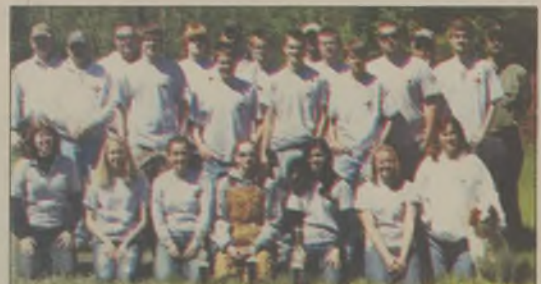
Schools' hunter safety teams to compete at state — page 8